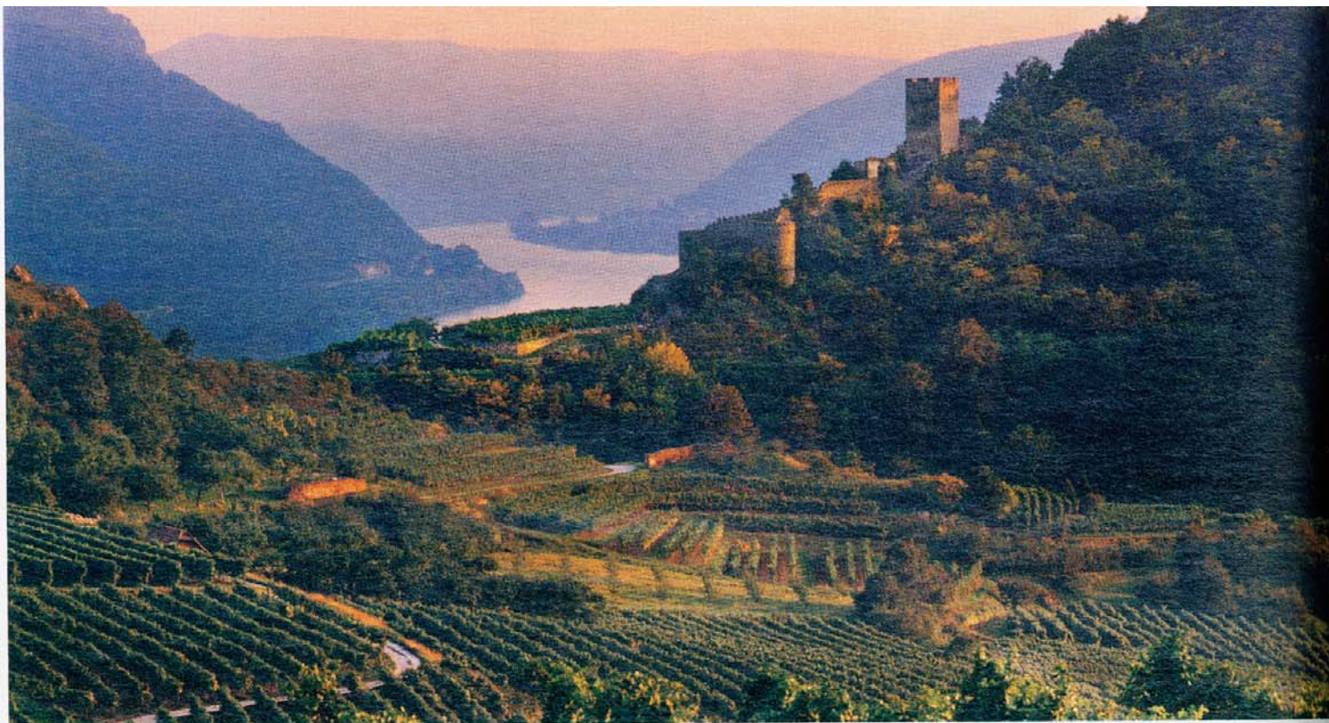
Vineyards in the Wachau, with the Danube in the distance. Although small in terms of vineyard acres, the district consistently produces Austria's best Rieslings and Grüner Veltliners.

2008). Two producers' classic-rated 2007 Wachau Rieslings offer bold stylistic contrast. The FX. Pichler Riesling Smaragd Trocken Wachau Loibner Steinertal (95 points, $68) is on the creamy side of the spectrum, spicy and rich, with ripe white fruit flavors, while the Rudi Pichler Riesling Smaragd Trocken Wachau Weissenkirchner Achleiten (95, $95) is vibrant, intense and minerally.