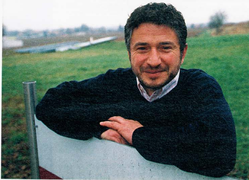
The Kamptal's Fred Loimer bottled a quartet of well-priced Grüners and Rieslings in 2007, all with outstanding scores.

Top 2007 Wachau Rieslings come in a wide range of delicious flavors: The elegant Alzinger Riesling Smaragd Trocken Wachau Steinertal (94, $78) offers vibrant pear, peach, grapefruit